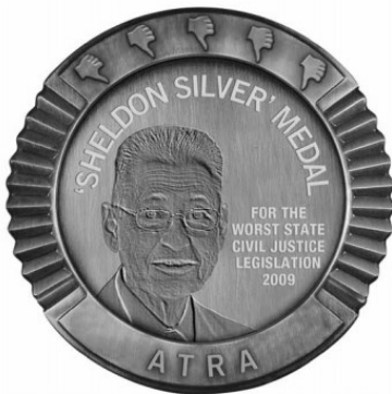
ATRA's annual "Sheldon Silver" Medal for the Worst State Civil Justice Legislation.

FACT: The trial lawyer lobby has thrived under Silver. Governor Cuomo has called the trial lawyers the "single most powerful political force in Albany." 6 Between 2010 and 2014, the group's lobbying spending set all time record highs, growing 51% to over $1.2 million. 7 In 2014 the average personal injury lawyer-legislator was paid $239,000 in outside income, almost three times their state salary. 8